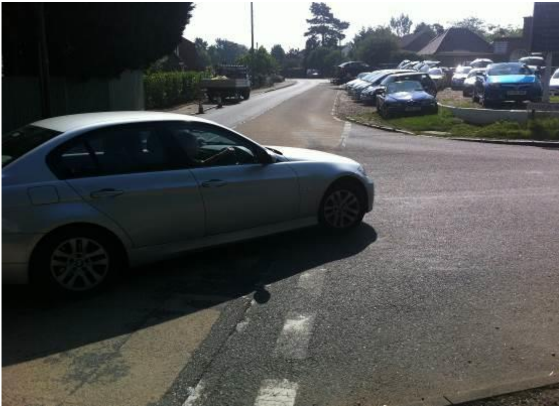
Photo 3 – Motorists cutting corner of the junction as they turn right into Common Road.

5.4 It was observed that numerous motorists appear to cut the corner of the opposing lane as they turn right into Common Road from B181 Epping Road. Whilst there doesn't appear to be any collisions recorded attributed to this movement it is possible that such movements could have led to some of the nose to tail type collisions that have been recorded on the Common Road approach to the give way lines.