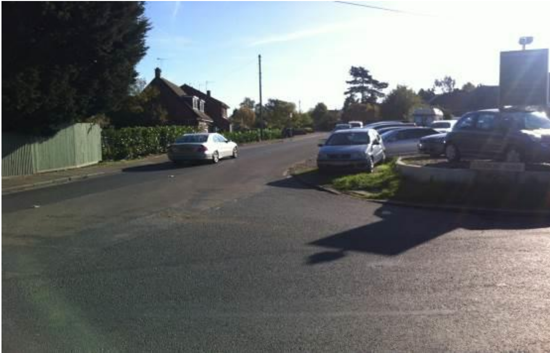
Photo 1 – Vehicles parked close to the edge of the carriageway on B181 Epping Road at the southern corner of the junction.