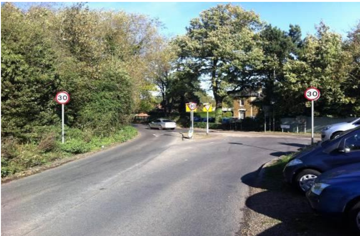
Photo 2 – Common Road approach to junction. Nearside 'Give way' sign obscured by vegetation. Other 'Give way' signs within central traffic island obscured by speed limit terminal sign.